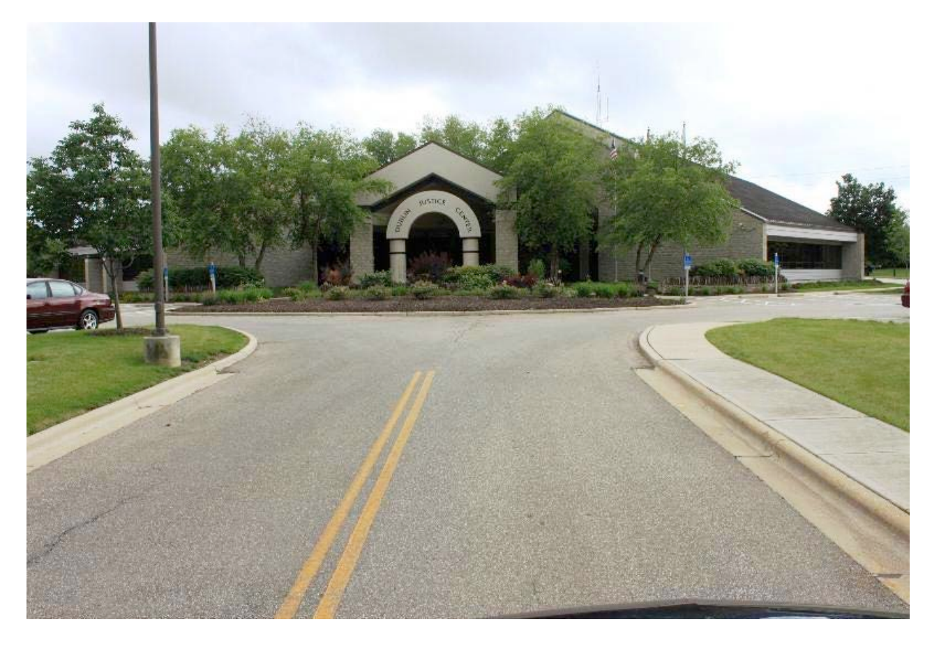
Mid Ohio Regional Planning Commission (MORPC)

HES, personnel completed a lead dust abatement project at the City of Dublin Firing Range. In total there were 10 rooms and 4 hallways that had to be cleaned to the Navy specs.